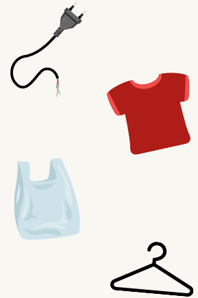
Pictured: a red t-shirt, a black coat hanger, a plastic shopping bag, and an electrical cord

In addition to tanglers, here are some other items that should stay out of your recycling bin: