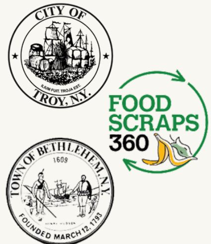
Pictured: City of Troy seal, Town of Bethlehem seal, and the FoodScraps360 logo.

To view the full report of the program's impacts, visit www.troyny.gov/foodscraps .