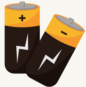
Pictured: a pair of batteries.

If these hours aren't accessible for you, STAPLES has a battery take-back program!