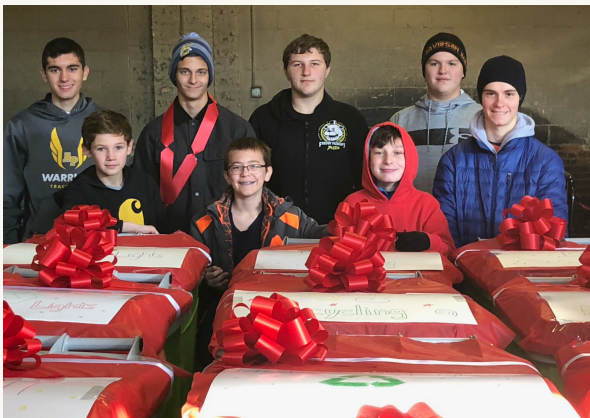
Pictured: members of Boy Scout Troop #2526 standing in front of barrels wrapped in paper with bows and other decorations.

It doesn't matter if you're the type of person to get out your string lights November 1st, December 1st, or any time after that to decorate - your broken, non-working string lights are recyclable through our special collection program at the following locations listed below. You can bring your old string lights to one of 11 locations throughout Troy. This program is in partnership with Boy Scouts Troop #2526 - a huge thank you to them for collaborating with us again this year!