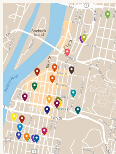
Pictured: Collar City Clean Up's Google map with past cleanups pinned, as well as amount of litter picked up.

For a map of previous clean ups (and the amount of litter picked up, visit goo.gl/maps/m3P4vhvWi7tRUcmt9