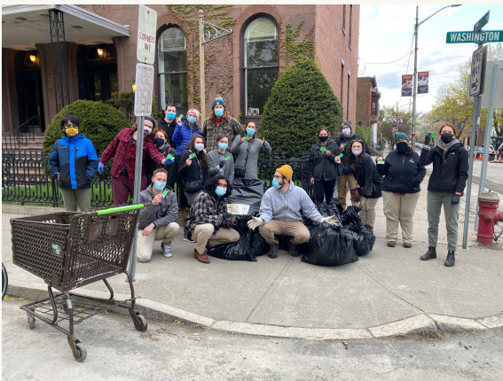
Pictured: a large group of people posed on a street corner with full bags of garbage.

A year later, Collar City Clean Up has collected 2,400 pounds of litter from the streets of Troy in collaboration with the City of Troy's Sanitation Team. Among this trash, some of the most common items are food packaging, disposable vapes, and the occasional diaper.